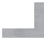
90° angled adjustment